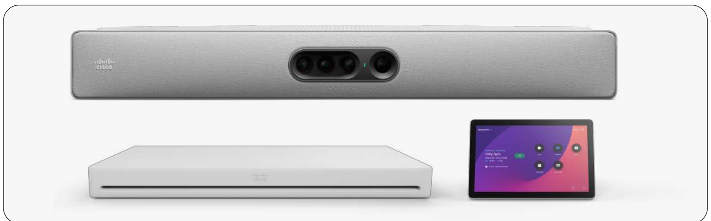
Figure 2. Main components of the Cisco Room EQ bundle: Cisco Codec EQ, Cisco Quad Camera, and the Cisco Room Navigator touch controller