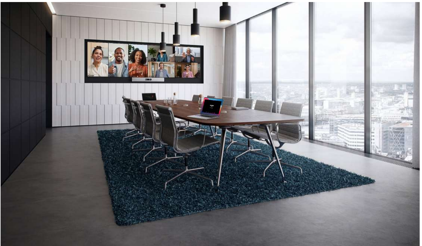
Figure 1. The Cisco Room Kit EQ in a conference room with the Quad Camera, the table-stand Room Navigator, and the Cisco Table Microphone Pro.

The Room Kit EQ provides optionality and extensibility with a highly modular setup to easily add touch controllers, cameras, speakers, microphones, and other room peripherals – easing the configuration and scaling of complex, multi-component audiovisual environments. This solution is rich in functionality and experience yet easy to deploy, maintain, and scale to your workspaces – and comes with unified cloud device management and workspace analytics in Control Hub.