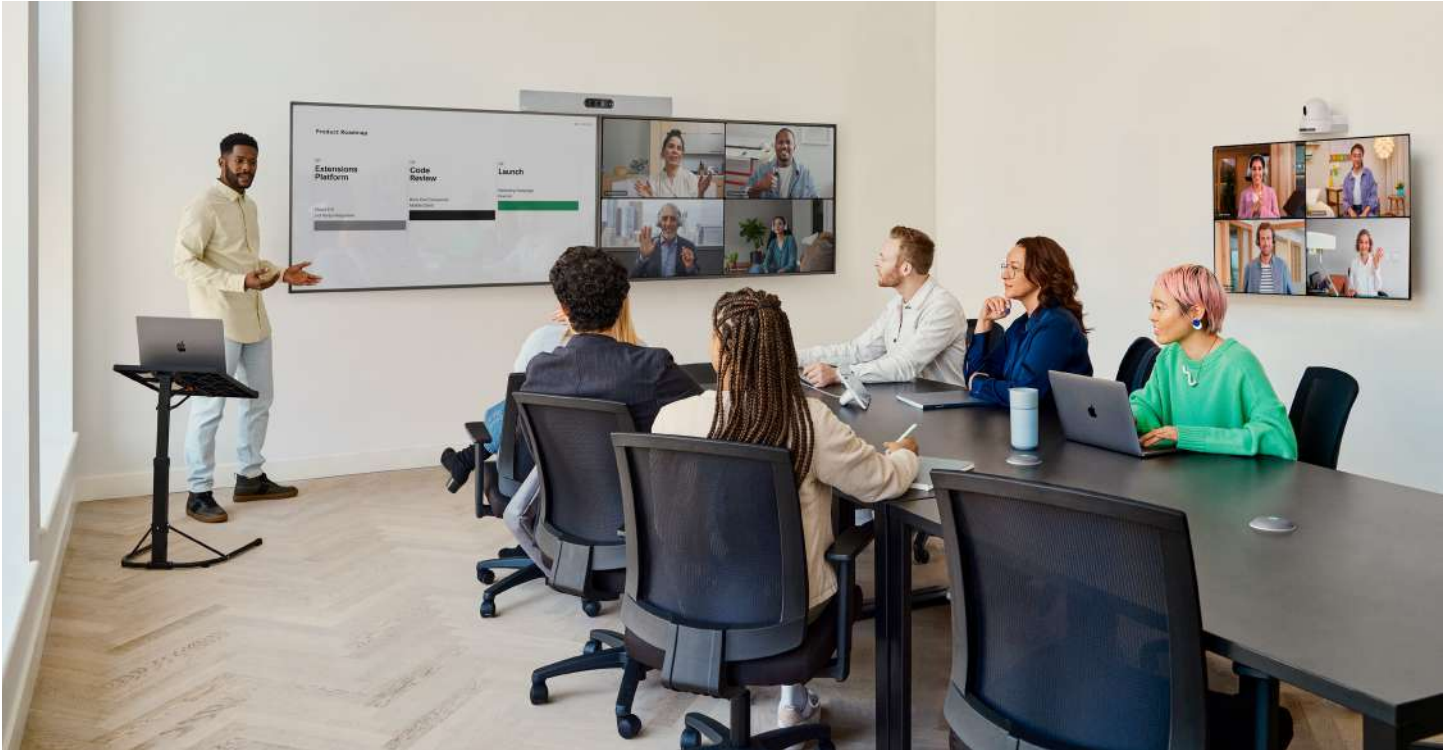
Figure 3. Cisco Room Kit EQ in a large training room featuring the Quad Camera, the PTZ 4K Camera, the Room Navigator tabletop touch controller, and Cisco Table Microphone Pro devices.