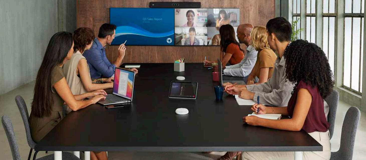
Figure 2. Cisco Room Bar Pro paired with dual flat screen displays for video meeting and content sharing running the native Microsoft Teams Rooms experience