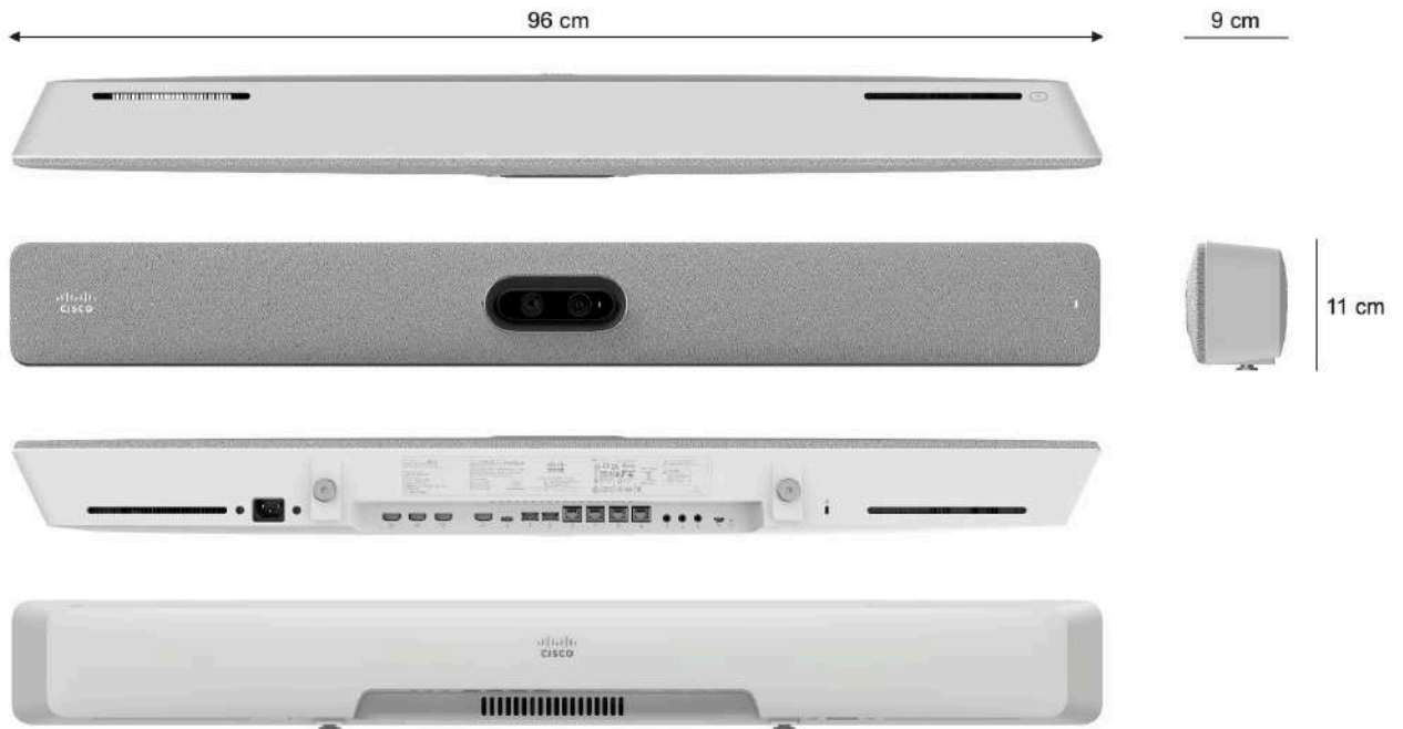
Figure 4. The Cisco Room Bar Pro video bar unit from top, front, side, bottom, and back view