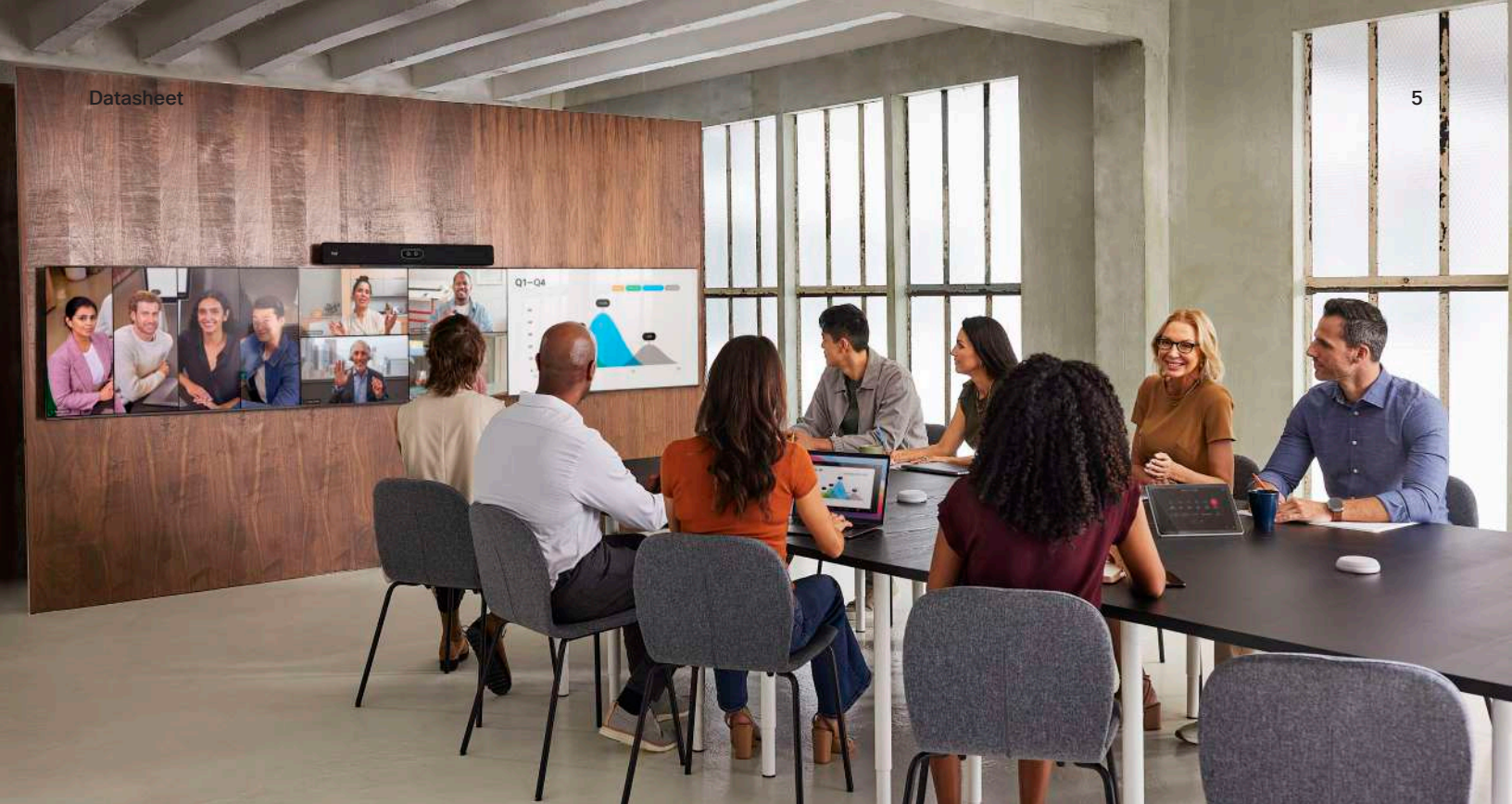
Figure 3. Cisco Room Bar Pro deployed with a triple-screen setup for video meeting and content sharing running the native Cisco RoomOS experience