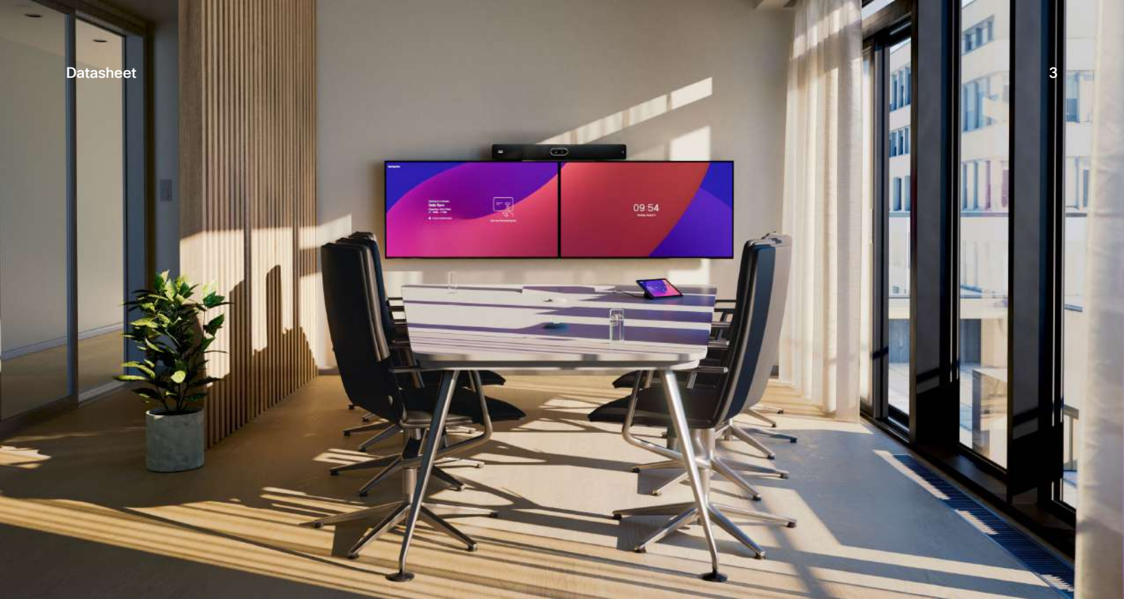
Figure 1. Cisco Room Bar Pro with dual flat screen displays for video conferencing in a medium-sized meeting room

Cisco Room Bar Pro is an integrated, AI-enhanced video bar solution featuring intelligent dual cameras, a three-channel loudspeaker system, built-in microphone array, a powerful computing engine and rich connectivity options, combined with an intuitive touch controller and smart room accessories to provide intelligent, inclusive video collaboration for medium-sized meeting spaces.