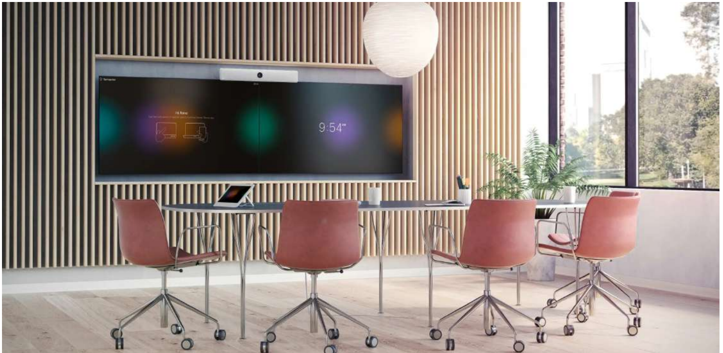
Figure 1. Webex Room Kit with a dual screen setup in a mid-sized meeting room