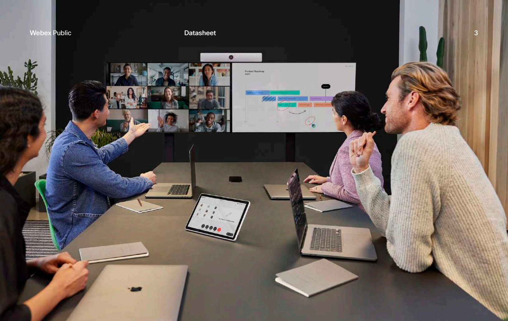
Above: Webex Room Kit in small room scenario

Webex Room Kit is a powerful collaboration solution that integrates with flat panel displays to bring more intelligence and usability to your small to medium-sized meeting rooms—whether registered on the premises or to Webex in the cloud.