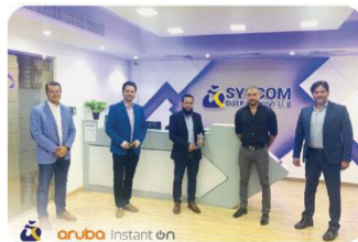
Syscom Distributions LLC Aruba Instant on Award