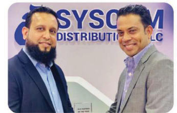
Syscom Distributions LLC Fortinet Award