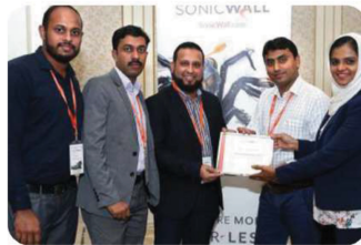
Syscom Distributions LLC SonicWall Award