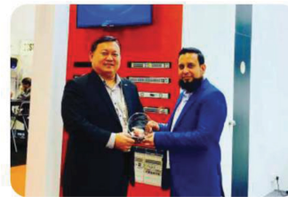
Syscom Distributions LLC Allied Telesis Award